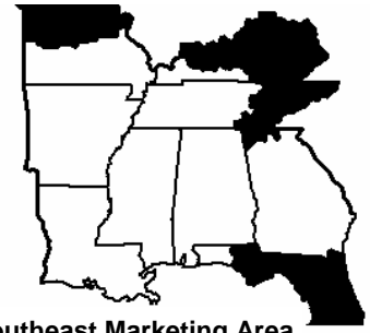
Southeast Marketing Area Federal Order 7