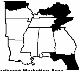
Southeast Marketing Area Federal Order 7