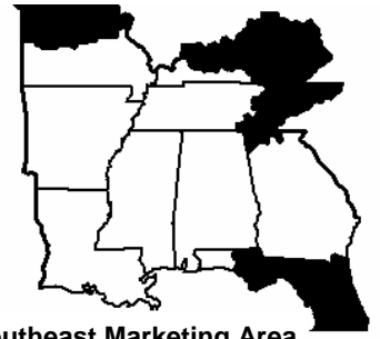
Southeast Marketing Area Federal Order 7