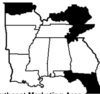
Southeast Marketing Area Federal Order 7